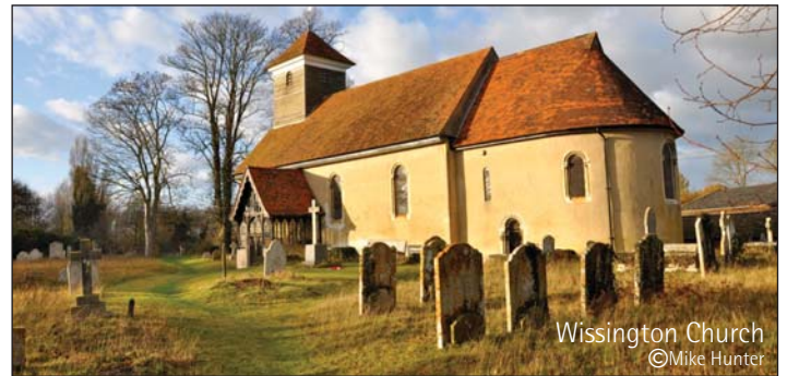
Wissington Church