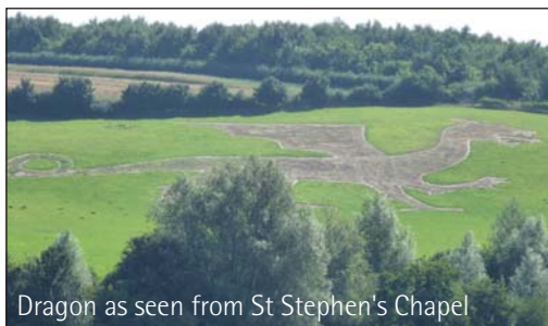
Dragon as seen from St Stephen's Chapel

From the south side of the chapel, looking east, you can see on the facing hillside (private land) a huge landscaped dragon... It can be seen striding along as if about to seek refuge in Wormingford Mere, which lies in the Stour Valley below, just into Essex. He looks best in the evening sun.